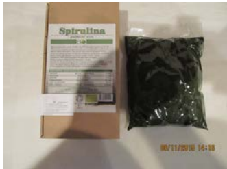
Figure 1. Lyophilized spirulina and transformed into fine powder

Research Platform "Sustainable Ecological Agriculture, and Food Safety" from USAMVB Timisoara, Romania. Lyophilization was carried out at a temperature of -53^{\circ}\text{C} and a pressure of 0.05 mTorr.