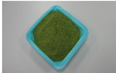
Figure 2. Lyophilized cilantro and transformed into fine powder