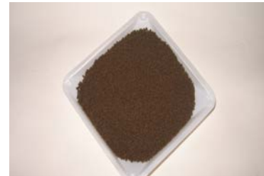
Figure 3. Final regranulated pallets designed to Prussian carps' feeding