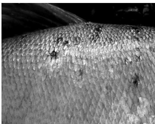
Figure 3. P. cuticola metacercariae in Hypophthalmichthys molitrix – dermal location